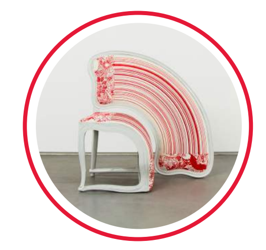
Sebastian Brajkovic, "Lathe V Chair," 2008. Collection Museum of Arts and Design, New York. "Design by Time" is organized by the Department of Exhibitions, Pratt Institute, Brooklyn, New York, and is curated by Ginger Gregg Duggan and Judith Hoos Fox of c2 curatorsquared.

From the Pratt Manhattan Gallery comes Design by Time , an exhibition with work from 22 international designers portraying time and its dynamic effects on fashion, furniture, textiles, vessels, and more . In this exhibition, the featured designers employ all manner of influences – chemistry, crystallization, magnetism, astronomy, oceanography, and the more expected forms of drawing, music and weaving – to portray relationships between time and creation, its relationship with nature, and its inevitability.