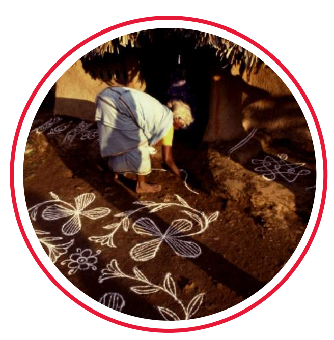
From "Across the Threshold of India"