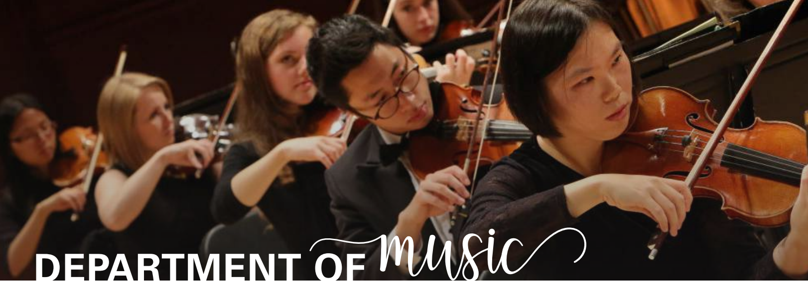
Raleigh Civic Symphony