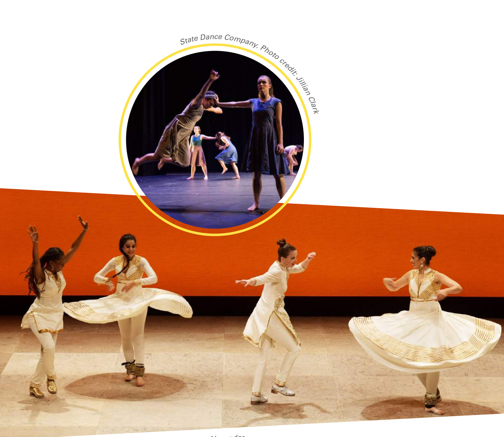
NC State LIVE presents SPEAK.

NC State students may purchase tickets to Arts NC State performances for $5-$10 depending on the event. Buy in person at Ticket Central, online at tickets.arts.ncsu.edu, or by phone at 919.515.1100. Call Ticket Central with any questions (open 1-6pm during fall and spring semesters). Ticket Central accepts cash, checks and MC/Visa/AmEx. Your campus ID is required for discounted tickets.