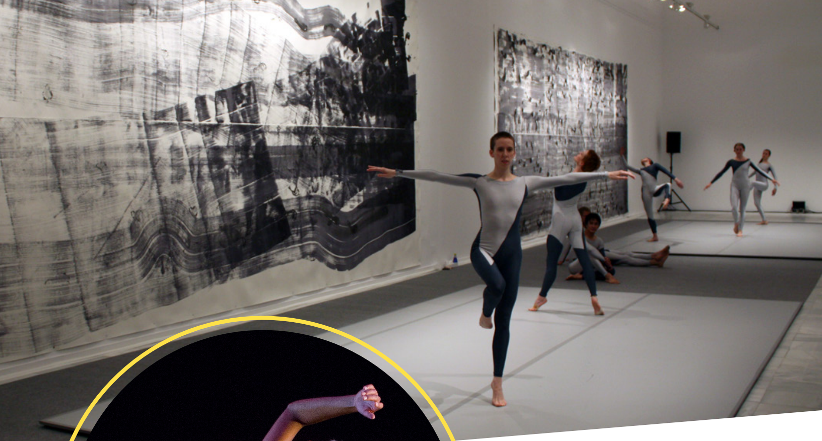
Photo Credit: Image from a Mountain Lake Workshop featured at the Crafts Center; Raykass.com